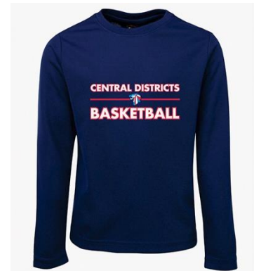
Warm-up Top (mandatory)

Uniform orders are placed through TeamApp via the online Store.